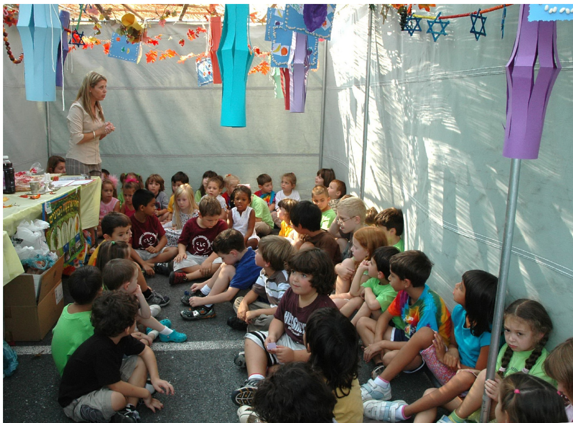
Photo of JRLW's sukkah last year, with area children visiting.